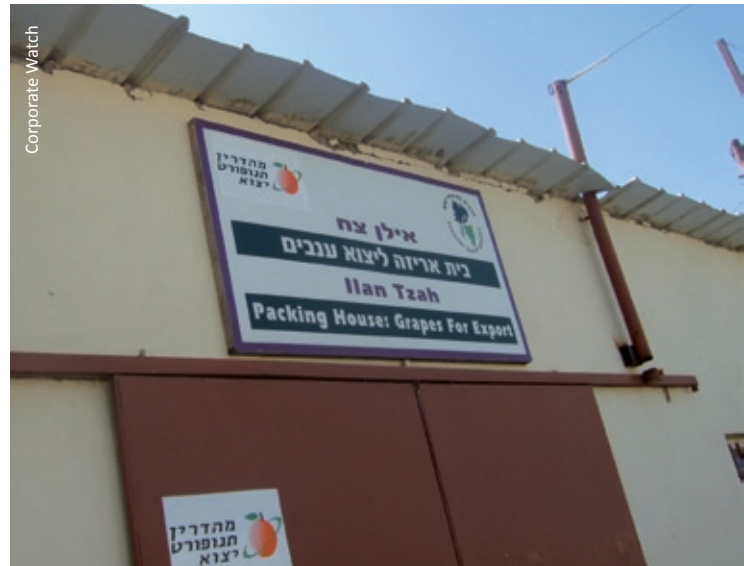
Mehadrin logo in Hebrew on a building in the settlement of Beqa'ot

Mehadrin also collaborates with Mekorot, the Israeli state water company, to supply water to its farmers and thus participates in the appropriation of Palestinian water. Workers in Mehadrin packing houses have spoken of grossly exploitative working conditions.