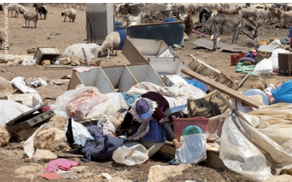
Left: A woman sifts through the ruins of her home after a demolition in the Bedouin community of Al Hadidye that left 32 people homeless. Agricultural export company Mehadrin operates in the nearby Beqa’ot and Ro’i settlements.

Israeli agricultural companies also undermine Palestinian production by dumping produce into the Palestinian market at times of peak Palestinian production. 56